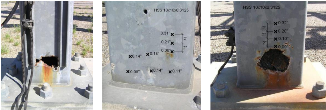
Fig. 1. Typical steel columns damaged by corrosion and measured wall thickness

the majority of the structural damage was on the inside of the square columns with little or no visible damage from the outside.