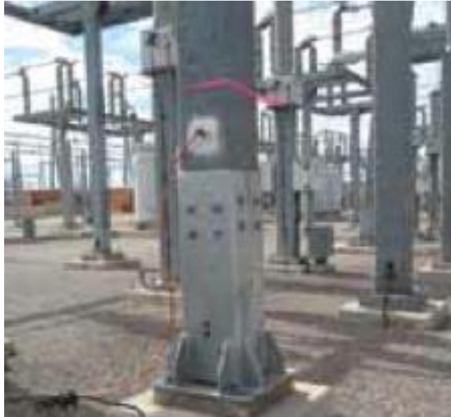
Fig. 3 Original repair using steel collars

FRP products had been introduced in the late 1980s for repair and strengthening of existing structures (Ehsani & Saadatmanesh, 1990). The original technique for application of these is known as wet layup. In