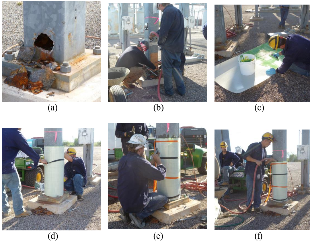
Fig. 6. Various stages of repair of corroded steel columns

The repair of the columns with laminates was aimed at strengthening the lower 3 feet of the structures. First, the corroded material that had separated from the inside of the structure was removed and the column was cleaned of any rust (Fig. 6a).