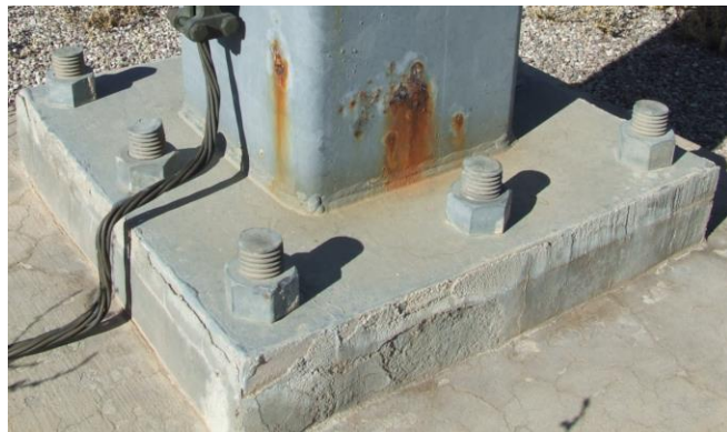
Fig. 2. Concrete grout at the base of the columns

Since the majority of the structural damage was found to be on the inside of the square columns, it was concluded that the damage is most likely the result of deficiencies during the galvanizing process. It is likely that the acid bath was not properly drained from the columns during the prepping stage causing the inside of the square columns near the base not to be galvanized properly. In addition, during the installation of these columns, grout had been placed between the base plate and the foundation. This caused rainwater to be trapped inside the structure, which accelerated the corrosion process.