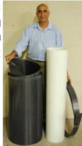
Fig. 5 - From left to right: Carbon and glass super laminates; carbon strip

Super laminates are constructed with specially-designed equipment. Sheets of carbon or glass fabric up to 60 inches (1.5 m) wide are saturated with resin and passed through a press that applies uniform heat and pressure to produce the laminate (Figs. 4 and 5). Super laminates offer three major advantages over conventional laminates. First, by using a combination of unidirectional and/or biaxial fabrics, the laminate may provide strength in both longitudinal and transverse directions; this is a tremendous advantage that opens the door to many new applications (Table 1). Secondly, they are much thinner than conventional laminate strips; with a typical thickness of 0.025 inches (0.66 mm), they can be flexible enough to be formed into various shapes in the field. Lastly, the