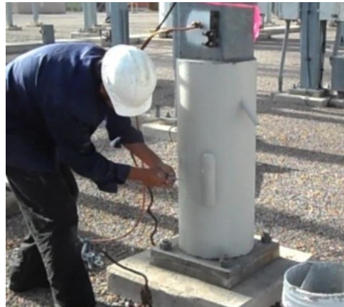
Fig. 7 Completed repaired column

After several hours, the ratchet straps were removed and the exterior of the shell was painted with a UV-protecting coating (Fig. 7). All of these repairs were performed while the substation remained fully operational.